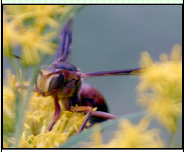
Blue-Black Spider Wasp