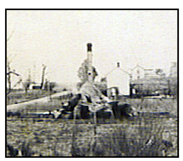
Photo taken by Helen Keys during January 1937, after the home burned